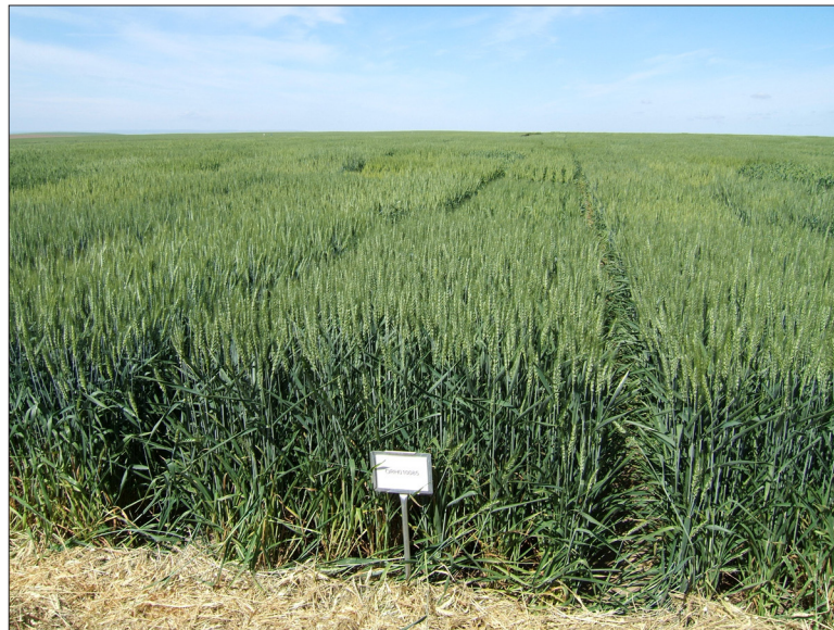
Figure 4. Skiles wheat.