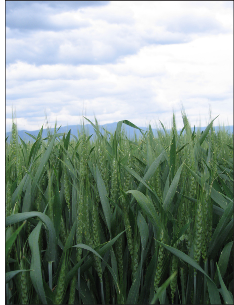
Figure 2. Skiles wheat.

The plant height of Skiles averaged 32.4 and 31.5 inches in trials over 19 site-years in Oregon and 39 site-years in Washington, respectively. Height is similar to that of Stephens and approximately 1 to 3 inches shorter than AP 700 CL, Brundage 96, Madsen, Masami, ORCF-101, ORCF-102, ORCF-103, Salute, Tubbs 06, Westbred 528, and Xerpha. Skiles is approximately 1 inch taller than Goetze (Tables 1 and 2). Straw strength of Skiles is good, and lodging has not been observed in any production environment.