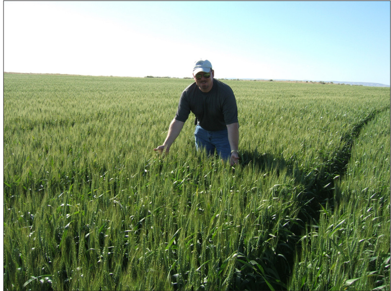
Figure 3. Foundation seed increase of Skiles wheat.

Seed of Skiles has been deposited in the USDA National Small Grains Collection, Aberdeen, Idaho (PI 658154). It is requested that the source of this material be acknowledged in future use by wheat breeding and genetics programs.