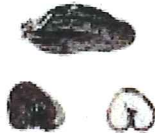
W-6.0 Heat Damage (Durum)