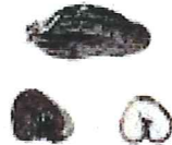
W-6.0 Heat Damage (Durum)