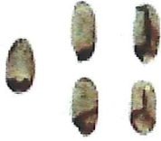
W-1.0 Black Tip Fungus

Wheat is considered damaged for inspection purposes only when the damage is distinctly apparent and of such character as to be recognized as damaged for commercial purposes.